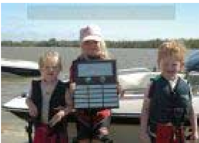
Future subbies with the Klipspringer trophy