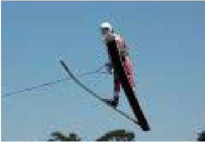
Matt Carroll jumping