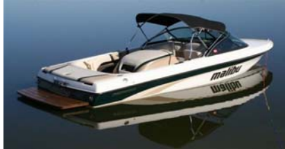
2003 Malibu Response $42,000-00 neg.