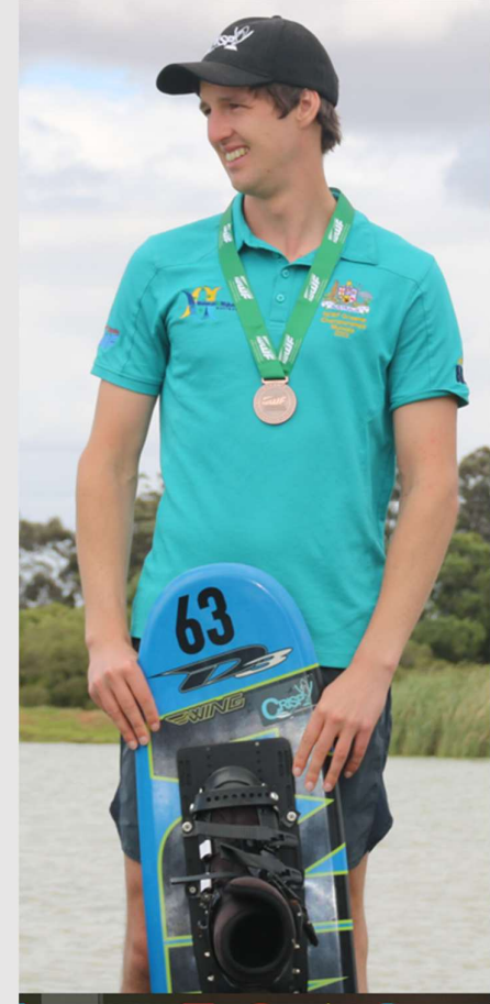
International Tournament Representatives from Geelong